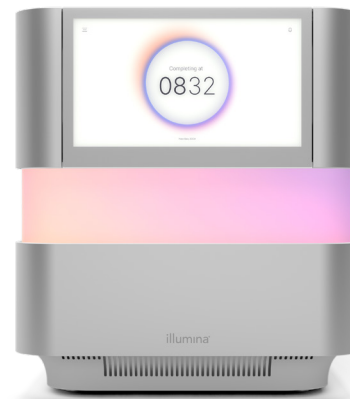
Figure 1: The NextSeq 2000 Sequencing System —The latest NGS system from Illumina offers innovative design features, advanced chemistry, simplified bioinformatics, and an intuitive workflow that enable the widest range of applications on a benchtop sequencing system.